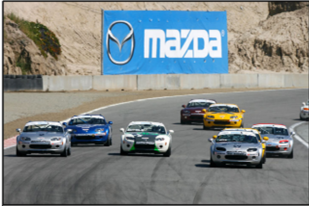
“MX-5 Cup restart at Mazda Raceway Laguna Seca”

You might find it hard to believe the recent Mazda commercial stating that more Mazda's are road raced on any given weekend than any other brand of car. Well, believe it or not this is indeed true. Mazda has ingeniously made the most of the pyramid of motorsports involvement.