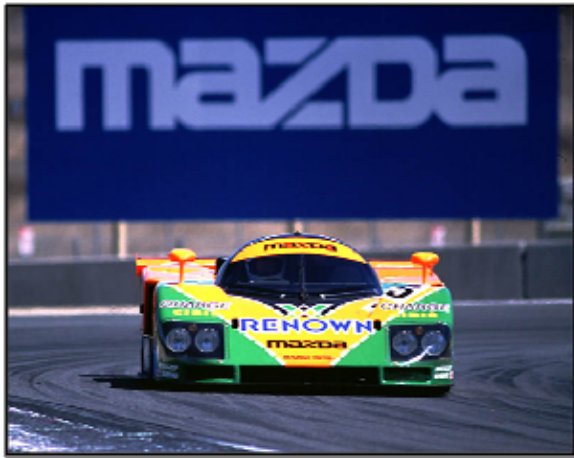
“Mazda 787B.” Photo courtesy of Bill Dunmire Mazda

racers of all kinds of Mazda vehicles and has also proven quite successful. MAZDASPEED currently has over 10 different race series that it has direct involvement with everything from open wheel racing such as the Star Mazda Series, to closed wheel racing such as the MX-5 Cup, Speed World Challenge, and Grand-Am series (5).