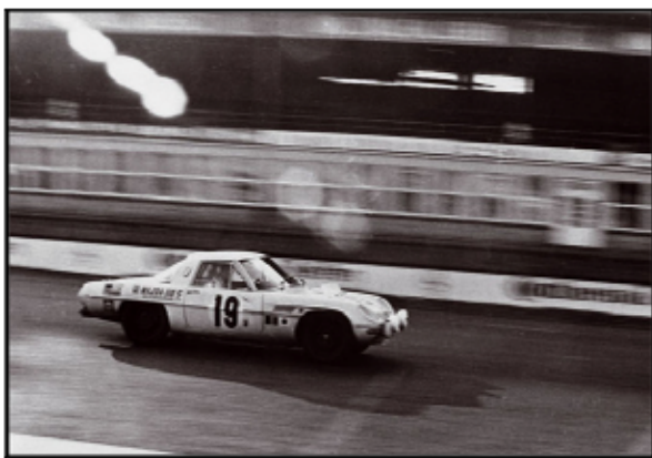
“Mazda Cosmo 110 at “Marathon de la Route”

They realize that the majority of the money in motorsports is spent at the grass roots level by thousands of weekend racers who are continuously trying to push their budgets to the limit. Mazda has catered to these groups by producing some true sports cars for the street such as the ever-popular mx-5 Miata as well as supporting racers at the grassroots level with programs like MAZDASPEED Motorsport Development which provides parts and services to those who race Mazdas. Mazda also participates in, and supports more forms of racing, and race series than any other manufacturer in the world and has created a development ladder allowing racers to progress all the way from karting and club racing to professional racing in both open and closed wheel racecars. However MAZDASPEED hasn't always been as popular as we know today. What we know as MAZDASPEED actually started over 40 years ago as a small independent race team in Japan.